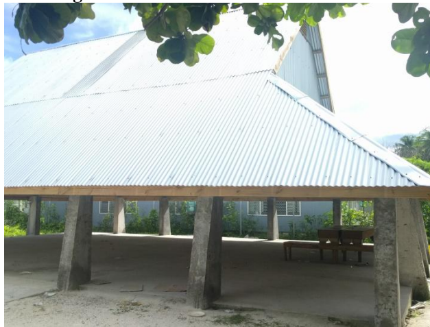
Figure 3A modern Mwaneaba in Tuvalu

Figure 3 photograph shows the modern Mwaneaba with zinc-sheet roofing in Tarawa, Kiribati