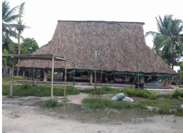
Figure 2A traditional Mwaneaba in Tarawa.

Figure 2 photograph shows the traditional Mwaneaba with coconut leaves roofing in Tarawa, Kiribati.