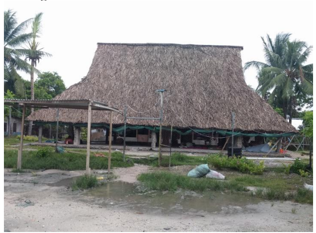
Figure 2A traditional Mwaneaba in Tarawa.

Figure 2 of the traditional Mwaneaba; Figure 3 shows the modern Mwaneaba) is the people or I-Kiribati's (Kiribati's citizens) own traditional way to "meet, discuss and decide on matters regarding managing and coordinating the people's tasks and roles" (interviewees' inputs; 100 percent). TeMwaneaba ("The meeting house"; Whincup, 2010: 117) represents "the unity", the "cooperation" and "smooth operations and functioning" of the lives of the people of Kiribati.