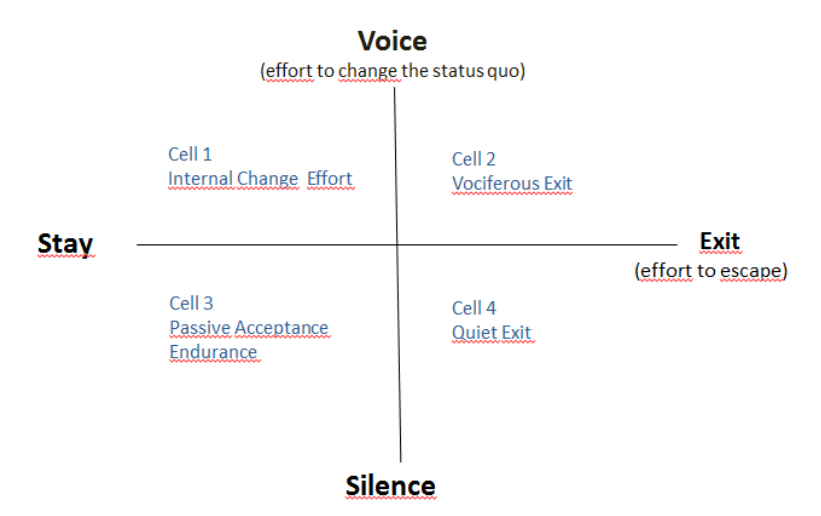
Fig. 1.Exit and voice. Potential responses to organizational decline according to Hirschman

Exit and voice are conceptually distinct, but that does not make them mutually exclusive forms of behavior. Exit can be combined with voice, or both can be rejected (see Fig.1).