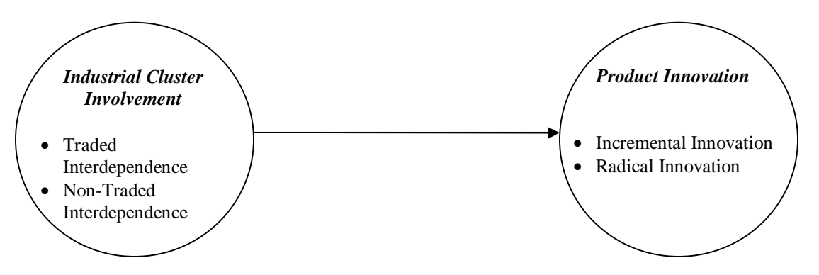
Figure 1: Model of the Influence of Cluster Involvement on Product Innovation

Industrial clusters are recognized as a network-based system containing a variety of closely bound firms (James, 2005). This type of network formation is also characterized by linkages between actors that are created in a temporal or semi-temporal fashion, commonly centering on a problem or issue (Schmitz, 1999). Actors in network-based system have more access to learn from each other and integrate each other's knowledge until the problem is solved or the goal is achieved. In a cluster such as Silicon Valley, the entire region is organized to innovate and adapt continuously to fast-changing markets and technologies by frequent and synergistic information flow within the cluster. The network structure of the cluster encourages the pursuit of multiple technical opportunities through the spontaneous exchanging and regrouping of technology, capital investment and know-how for quick enhancement of a firm's existing capability and competence (Sexenian, 1994). As well, an atmosphere resides within an industrial cluster in which related technological breakthroughs and know-how are "contagiously floating in the air", and eventually may affect all the participating firms in this particular industrial cluster (Schmitz, 1999).