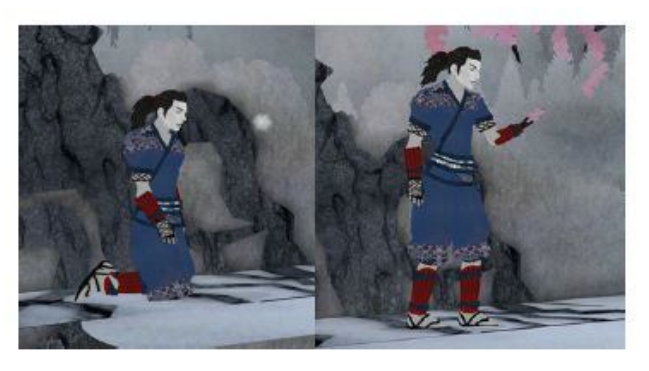
Figure 2: Character figure in "Tengami"