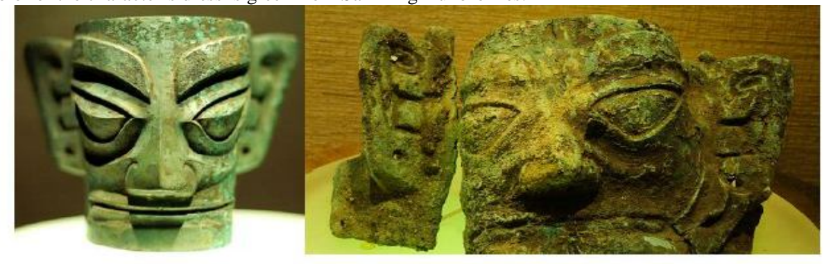
Figure 4: Reference diagram of bronze statues unearthed in Sanxingdui

The color of the character's dress is green from San Xing Dui bronzes.