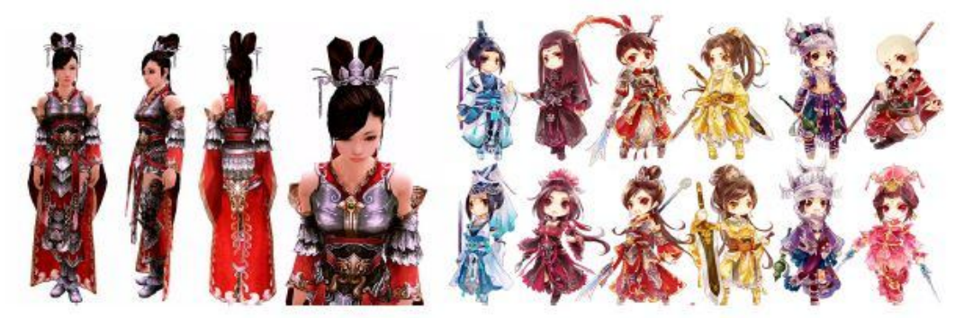
Figure 1 : Character design of parts in "Swordsman III Web Edition"

"Swordsman III Web Edition" is a 3D role-playing game independently researched and developed by King soft Xishan in China, the background of Tang era is integrated into the various traditional culture elements to show the martial arts world. The design of game character is of the style of Tang and Song Dynasty, especially in the character's clothing. The belt accessories and colors of ancient Tang and Song Dynasty clothing are used to determine the level and identity. Five-color is a popular color. The third figure is a character design of as words man. It can be seen from the male character design that the design color matching of the character clothing is the noble yellow. Clothing is the wide-sleeve crown brocade clothing of the emperor. Shoulder collar and five gorgeous trailing patterns are between birds and flowers, animal mask and moire; Belt hanging drop and the sword hand-holding are similar to brocade pattern. Chest is embedded with silver beast head decoration, and adorned with tassels hanging pendants. Such the clothing matching and character model all reflect the character's hidden and noble status. In official settings, this character is born in the noble family; self-aware of the sword principle, and is of brilliant swordsmanship in spite of his blindness.